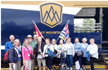
Our CCCPASR group ready to board our car on the Rocky Mountaineer.

During 2024 we had two fabulous trips to Broadway with great restaurants and musicals. We visited Ellis Island, the Statue of Liberty and the 911 Memorial. The Phillies played the Padres on a very hot afternoon. The year ended with a trip to the 1000 Islands.