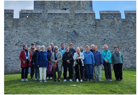
Ross Castle, Killarney, Ireland – May 2025